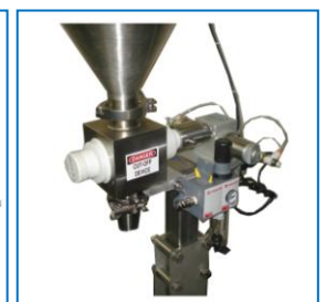
DPF-6000 for small volume fills (60 grams or less)