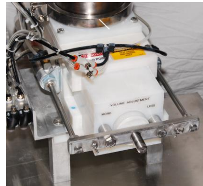
Turning the handwheel allows the operator to adjust the volume of fill