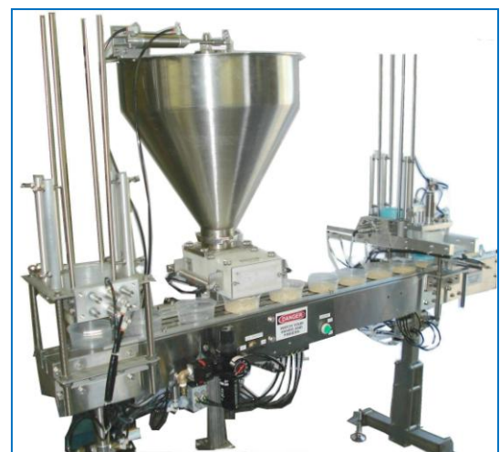
DPF-6000 with 6 ft. indexing conveyor, cup denester and lid placer