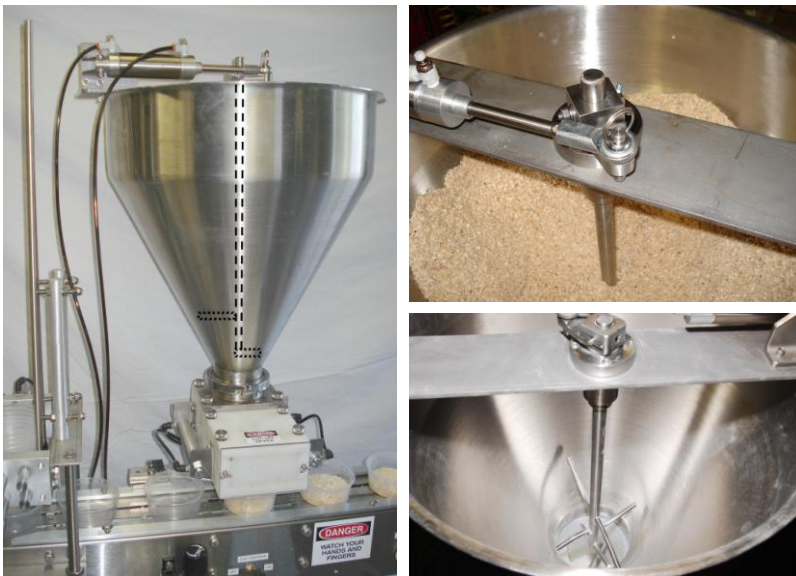
Optional Product Agitator keeps product from bridging