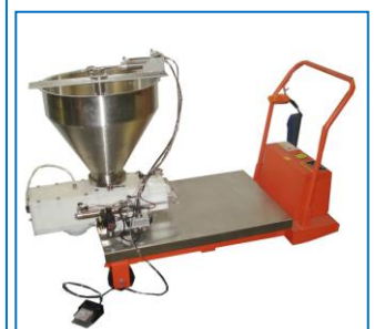
Optional electric scissor cart allows the operator to lower the machine to manually reload the hopper with product