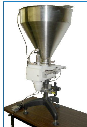
Table top Model

Model DPF-6000 with floor stand can be used as a stand alone unit or can be positioned over a conveyor for automatic filling.